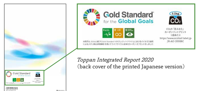
Toppan Integrated Report 2020 (back cover of the printed Japanese version)

https://ecoleaf-label.jp/pdf_view.php?uuid=c2743b52-521c-469b-a28b-3c698f0311ea.pdf&filename=JR-AO-20008C_JPN.pdf