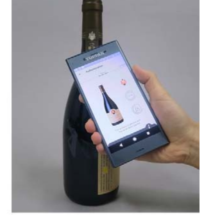
Authentication being performed