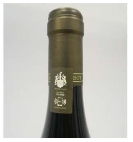
Domaine Ponsot Grand Cru wine bottle using Cachet-Tag